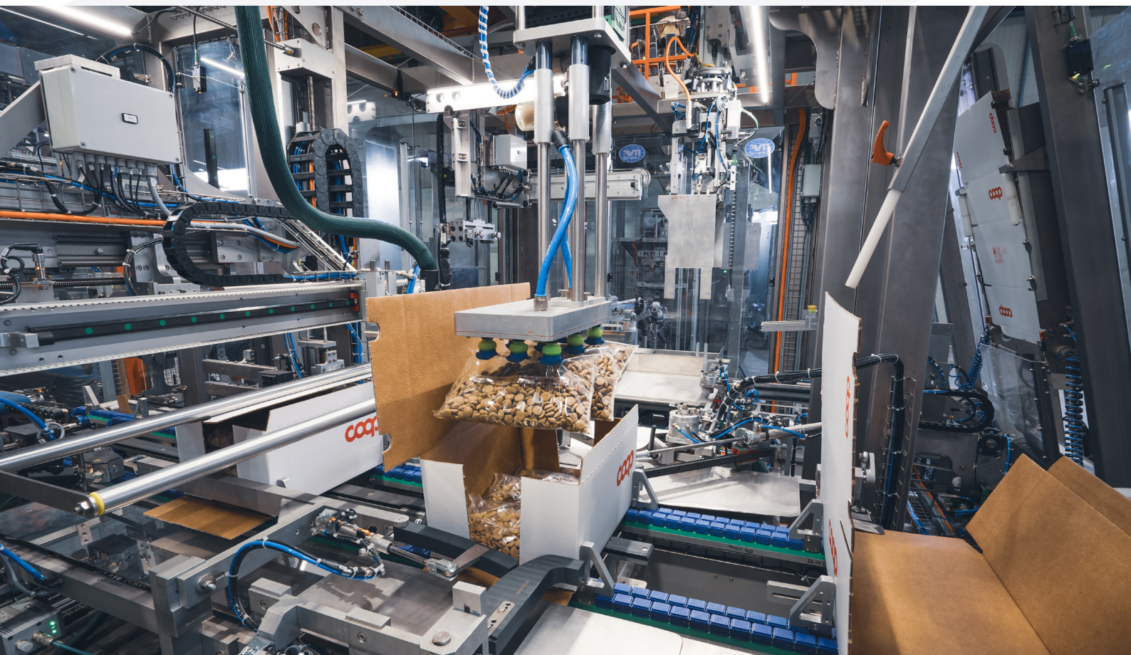
Laying flat Mosaic System

Designed to ensure maximum precision and speed, this machine is able to handle a wide range of products and formats, ensuring resistant packaging optimised for transport.