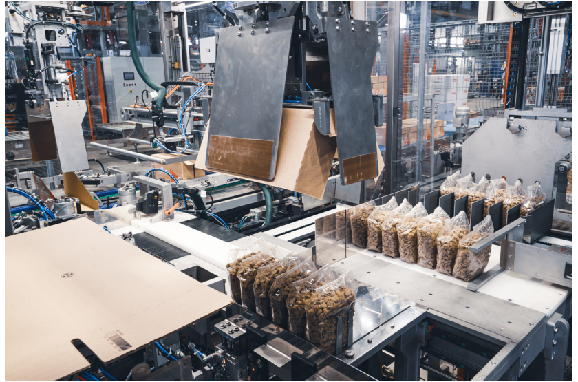
Standing Mosaic System

The Wrap Around Case Packer by MF Tecno is the ideal solution for the automation of packaging in wrap around cartons. This automatic machine creates the package directly around the product , starting from an open die-cut carton that is then sealed with hot melt glue, offering a versatile and customizable solution.